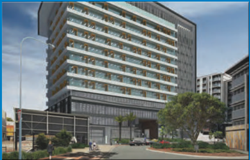
Projects Commercially coveted in Healthcare and Hospitality industries.

Thermalite Ultraclear Our Patented Ultraclear system provides a clear uninterrupted view .No tilt rod or controls which often malfunction and require repair. No unsightly rods showing and louvres will not lose tension.